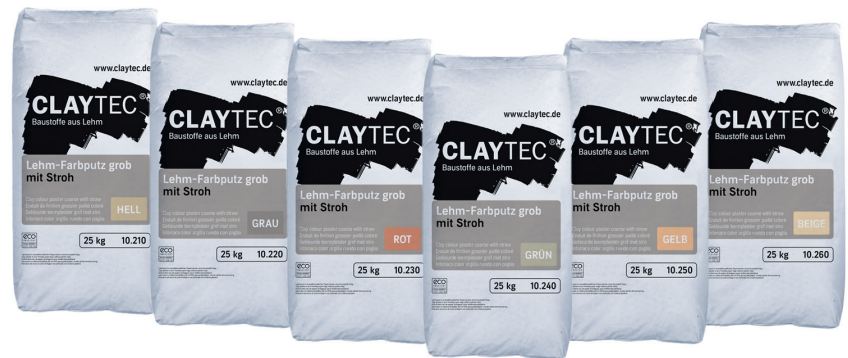
Different object layouts by colour