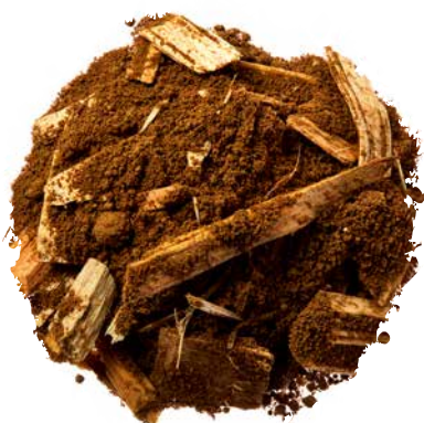
Woodchip light clay