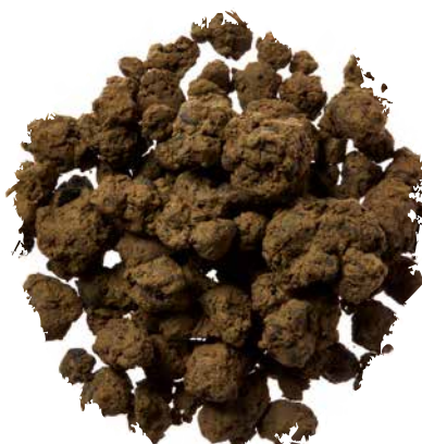
Expanded light clay